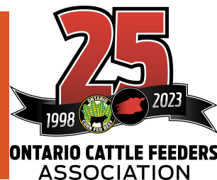
EXHIBIT SPACE APPLICATION & CONTRACT

WE WISH TO APPLY FOR EXHIBIT SPACE IN THE 25 th ANNUAL BEEF INDUSTRY CONVENTION (PLEASE PRINT CLEARLY)